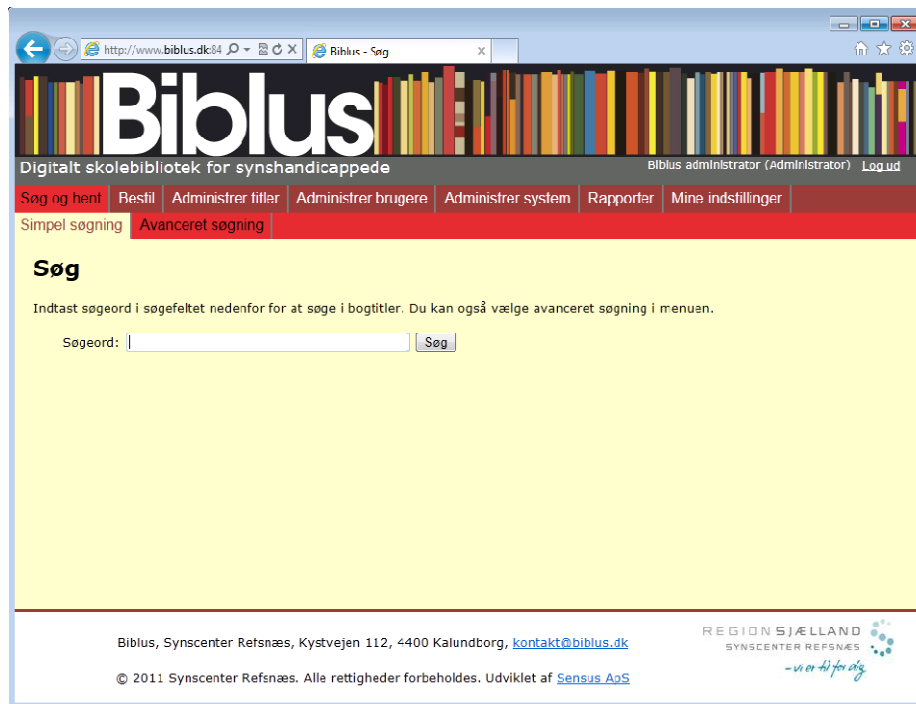
Fig. 2. The main Biblus interface when logged in as an administrator. The menu include Search and Retrieve, Order, Title administration, User administration, System administration, Reports and Personal settings. The user can furthermore switch between simple and advanced search.

Likewise, it is possible to add information on the readability, suitable age groups and subject matter for the material. Figure 2 below shows the main interface of the Biblus digital library when logged in as an administrator: